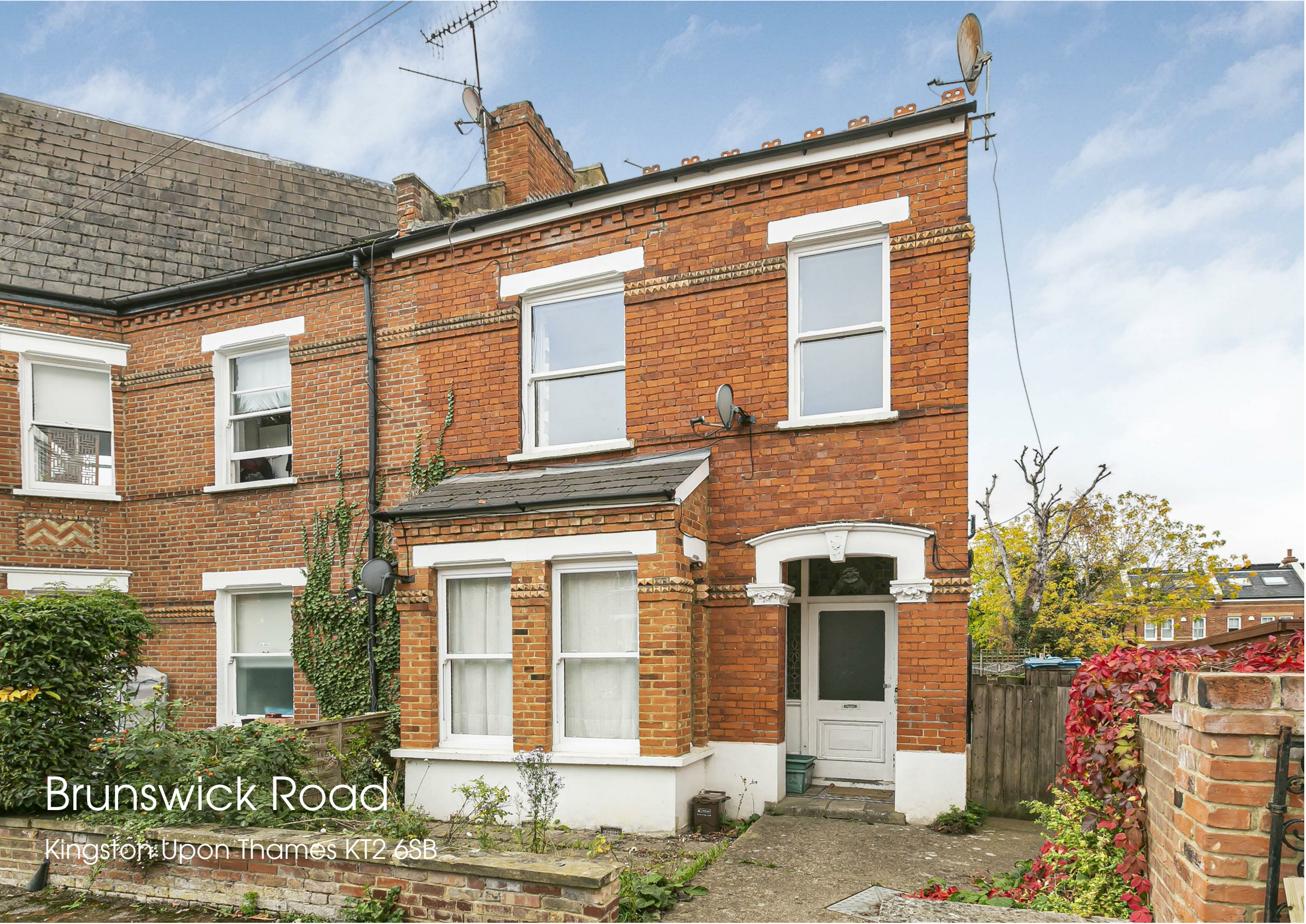
Brunswick Road Kingston Upon Thames KT2 6SB